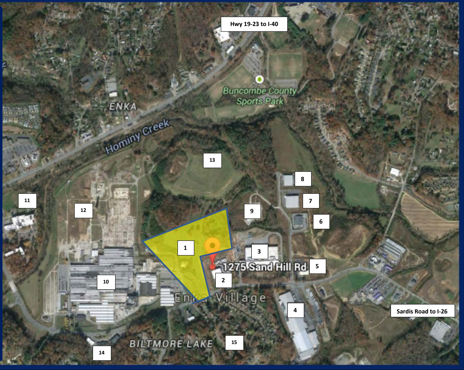
ENKA COMMERCE PARK: Satellite Image of Proposed Site with Neighboring Uses Identified